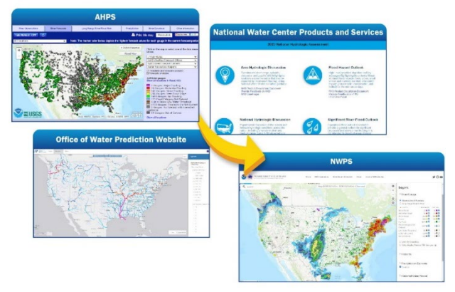
NWPS brings features from AHPS and OWP operational website into one webpage