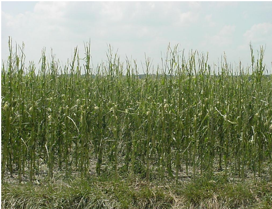
Extensive hail damage to a corn field 3 miles west of Oconee, Illinois in extreme eastern Montgomery county.