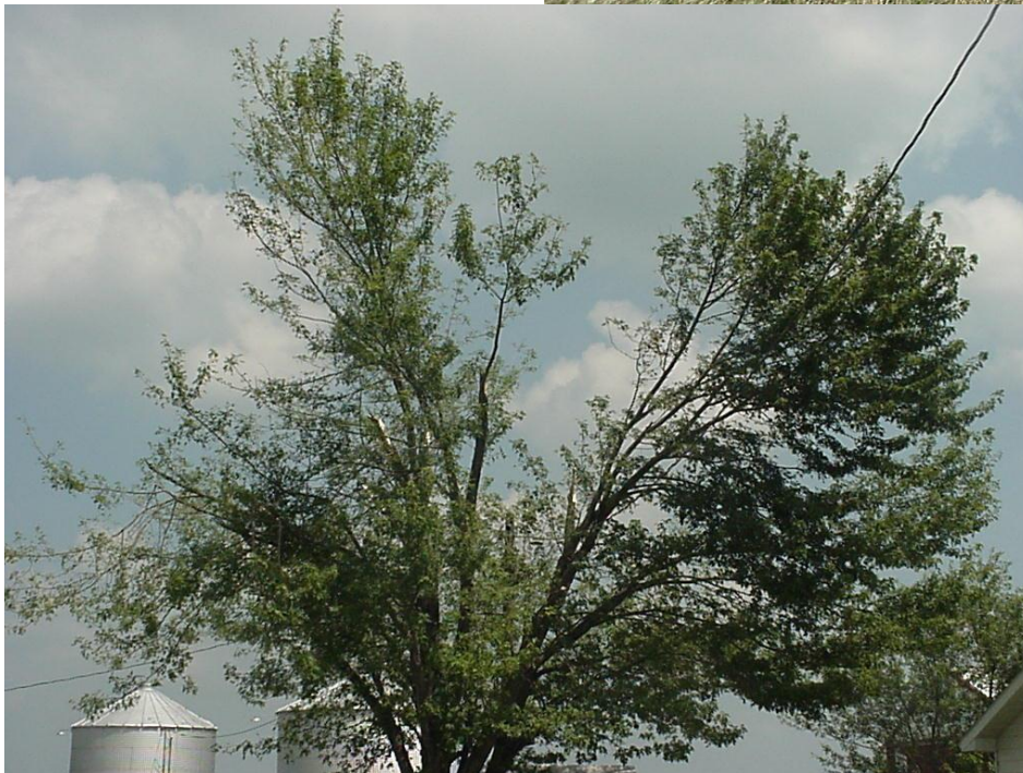
Typical damage to one of many trees (large branches down) 1.3 miles west of U.S. 51 and just south of the Fayette - Shelby County line.