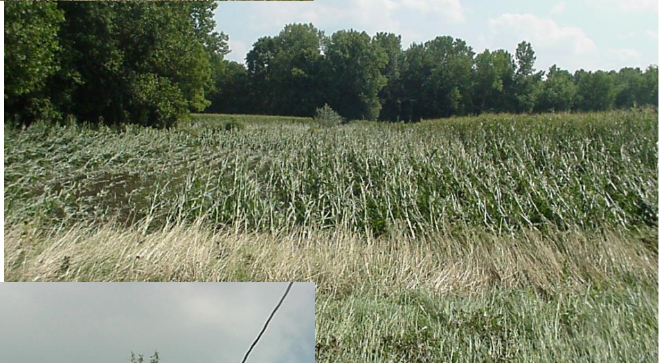
Corn flatten 4 miles west of Oconee, Illinois (250 yards west of the hail swath). Corn flatten by a localized microburst. Viewing south.